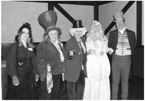
South Bay's annual Halloween costume contest brings to mind the high-jinx of the early Bohemian years of CWC.

We at South Bay experience rejuvenation—a glow comes out from the meeting room. People chat up the program; ask, suggest, and engage. No one leaves early, but with coffee and cake, hang around for exchange—enjoy a writing camaraderie.