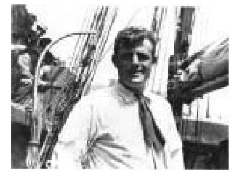
Jack London aboard the Snark.

This much we know for certain: an organization calling itself California Writers Club can be traced back to the Oakland area as early as 1909. We also know that Jack London was a leading light in the East Bay literary scene in the